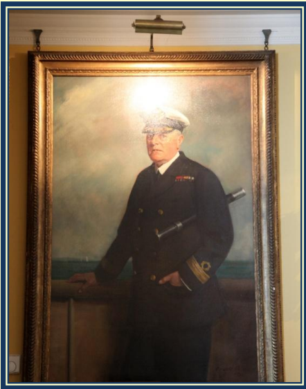
Traditional Picture Light