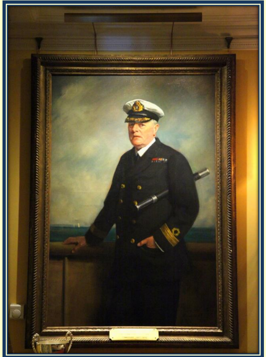
The Art Light