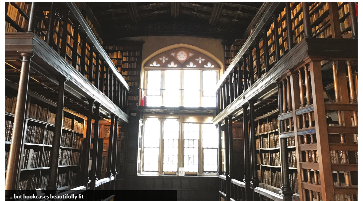
...but bookcases beautifully lit

'Wowzers!!!! Absolutely brilliant, well done all – superb result'.