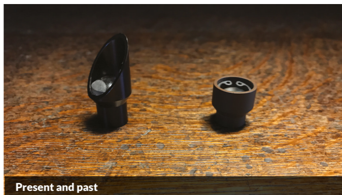
Present and past

All the advantages of fibre optic lighting have been exemplified in this installation which include: total care in conservation, excellent energy efficiency, minimal and easy maintenance, flexibility, discreet and elegant lighting, assured safety and durability and optimum light quality.