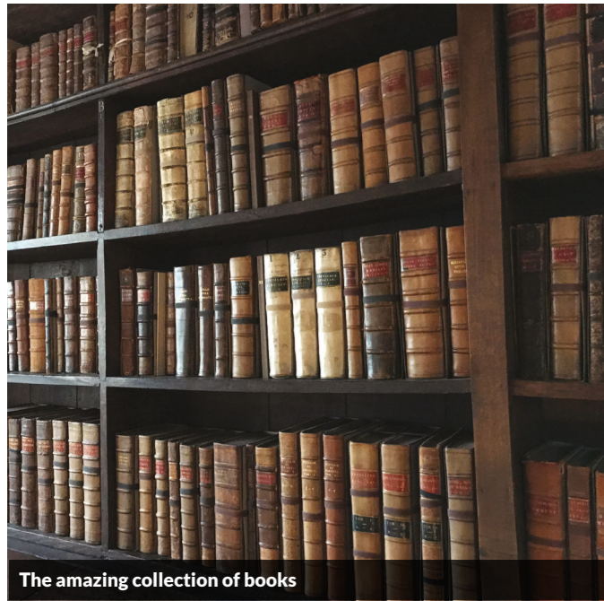
The amazing collection of books