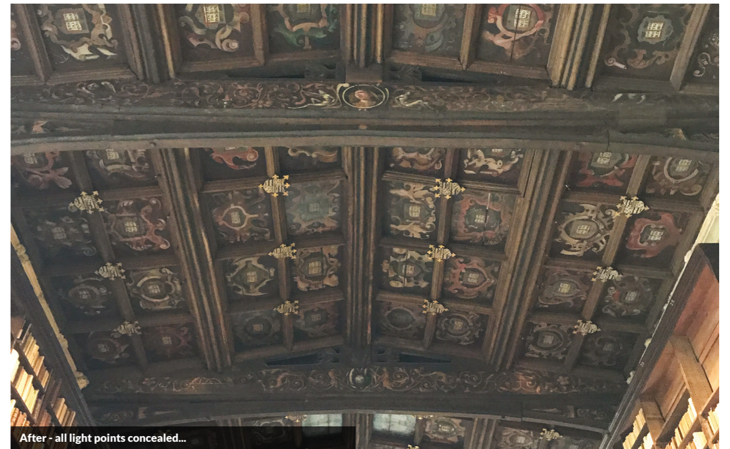
After - all light points concealed...