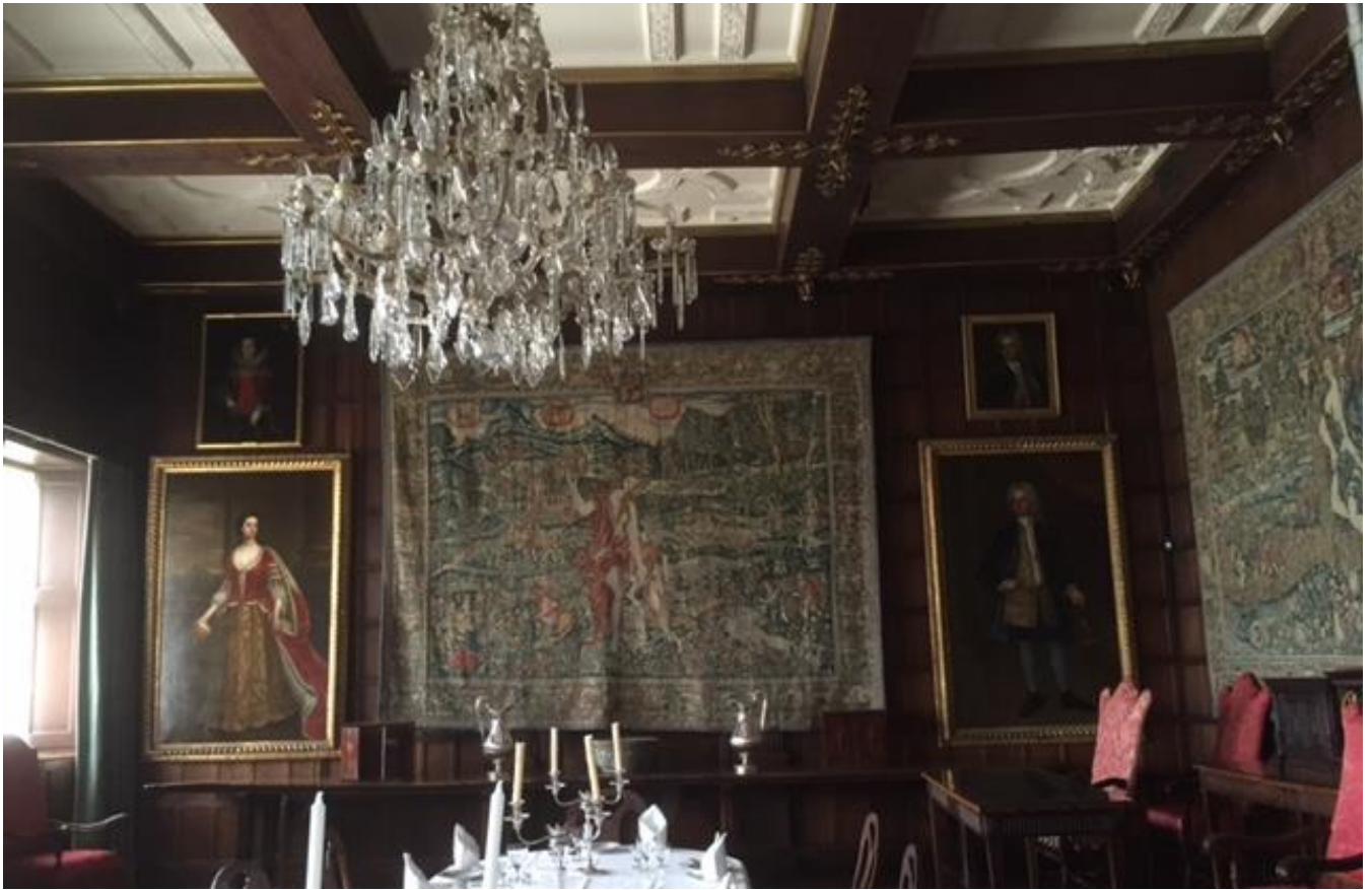
The Winter Dining Room: After fibre optic lighting is installed