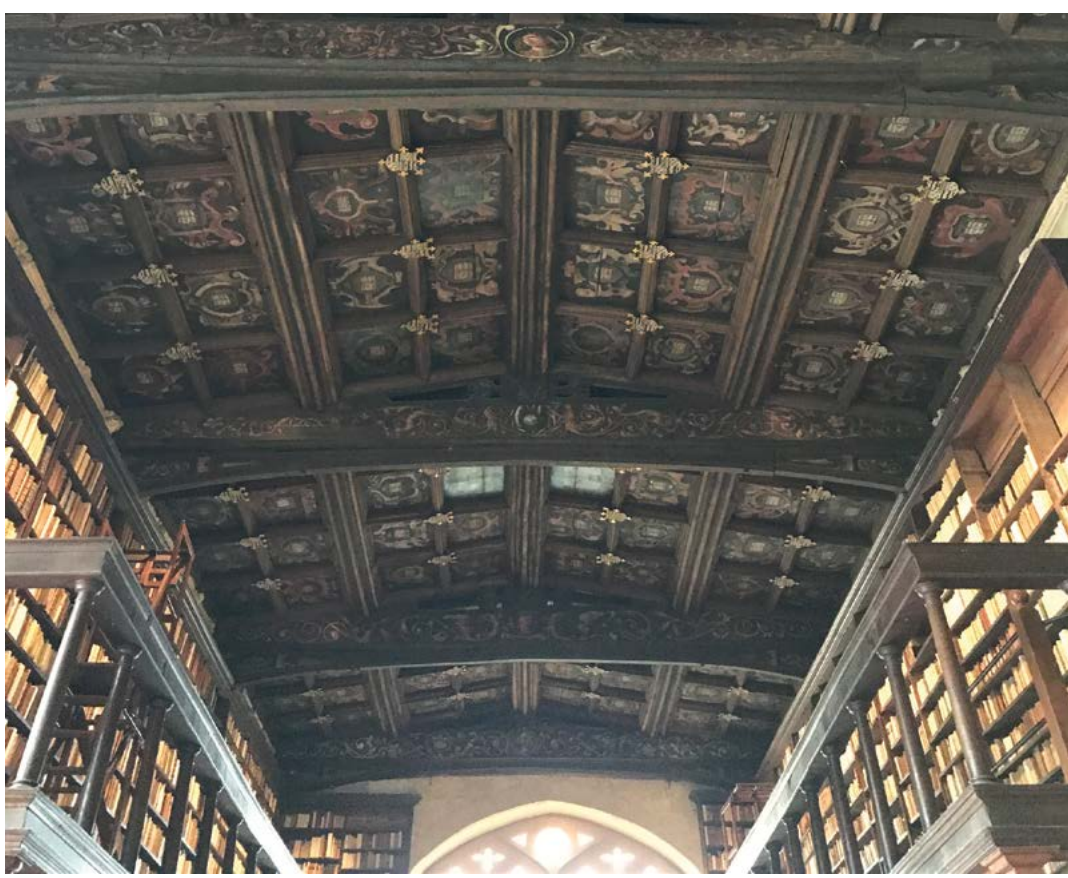
After - all light points conceale