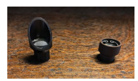
Present and pas